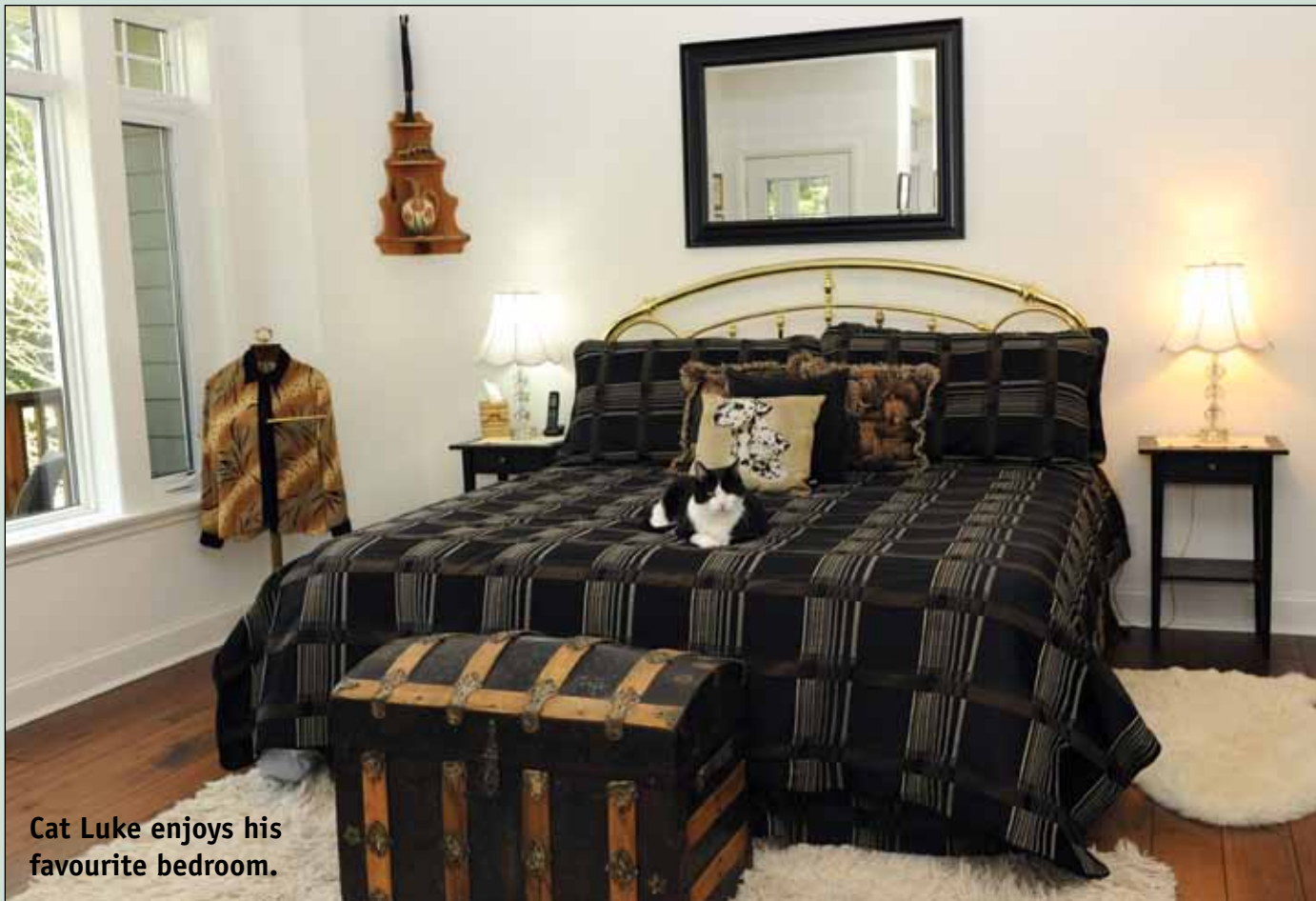
Cat Luke enjoys his favourite bedroom.