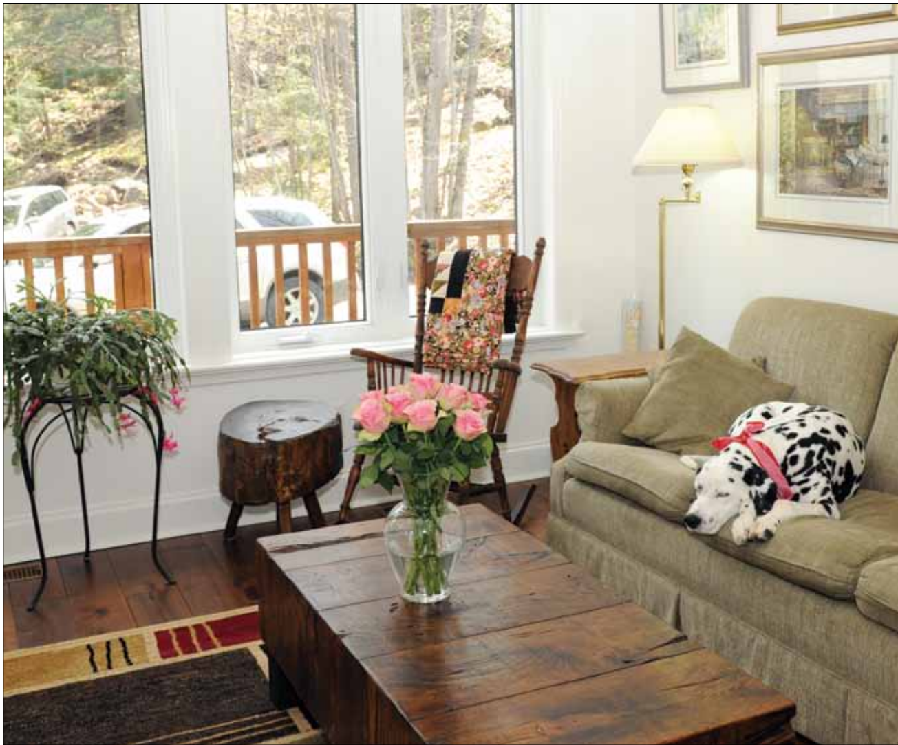
The family dog Chanti relaxes in the sunroom which is a favourite room for both animals and people (above). The master ensuite features a soaker tub (below).