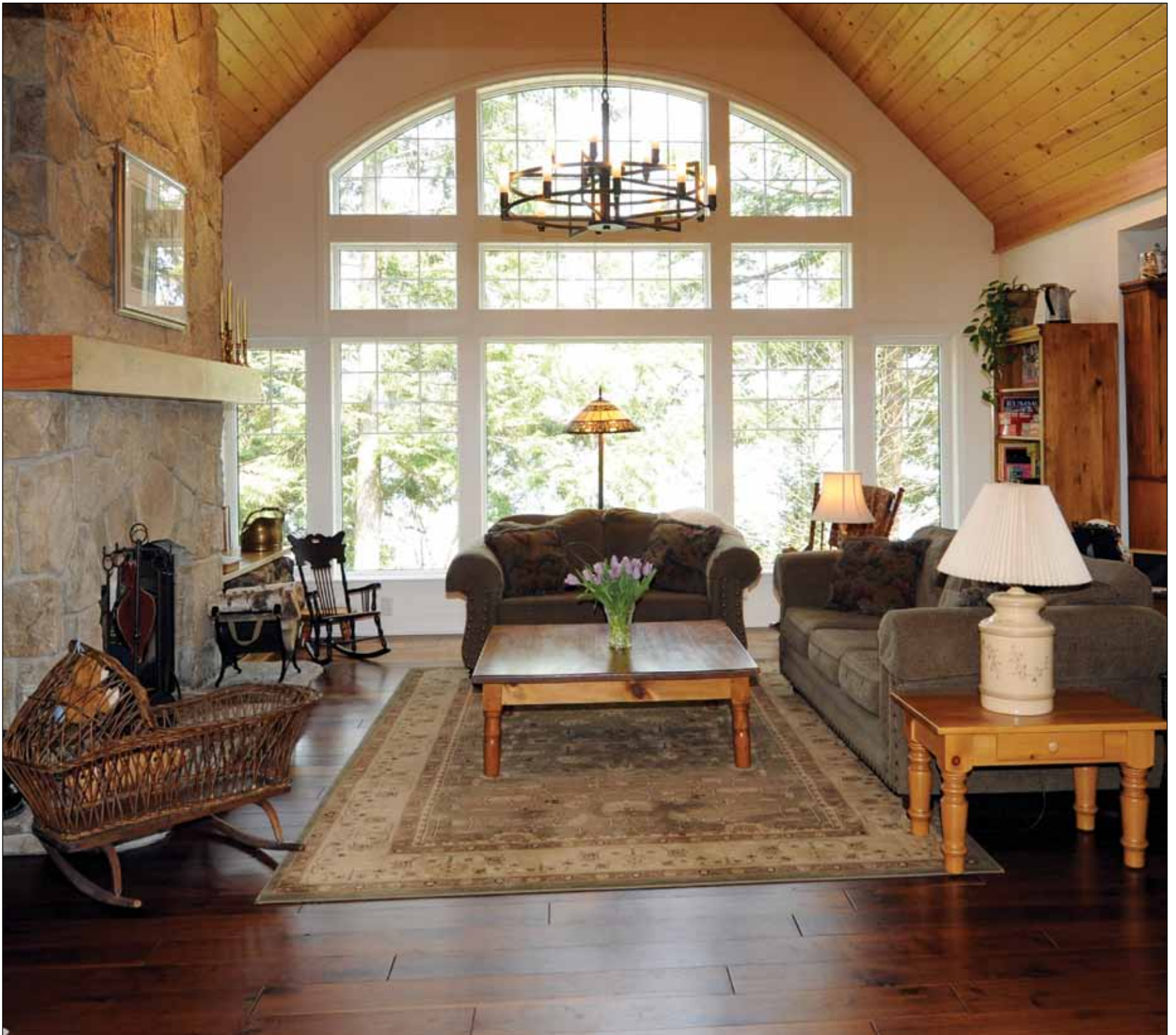
The new Sumner cottage has great room with lots of space for family to gather. It features a pine lined cathedral ceiling, a huge window with a expansive view and some family collectibles.