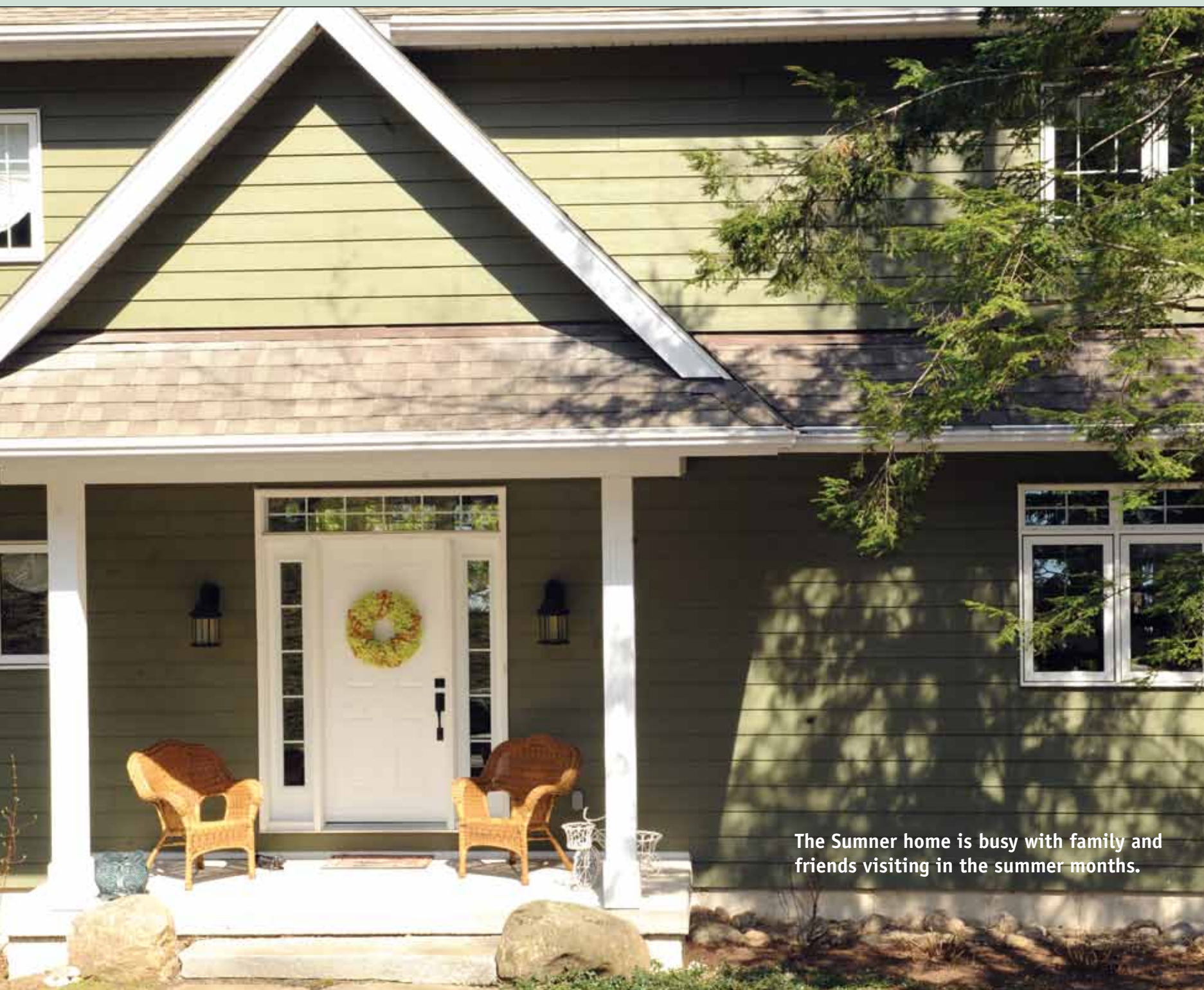
The Sumner home is busy with family and friends visiting in the summer months.