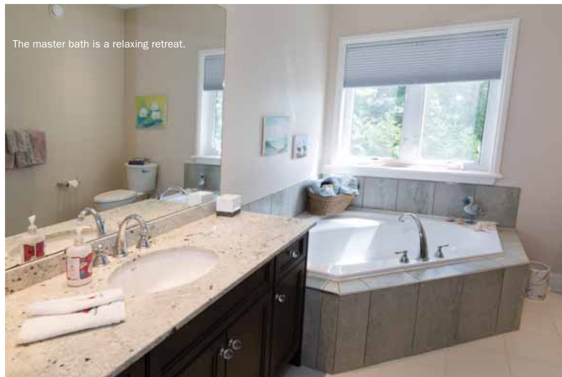
The master bath is a relaxing retreat.